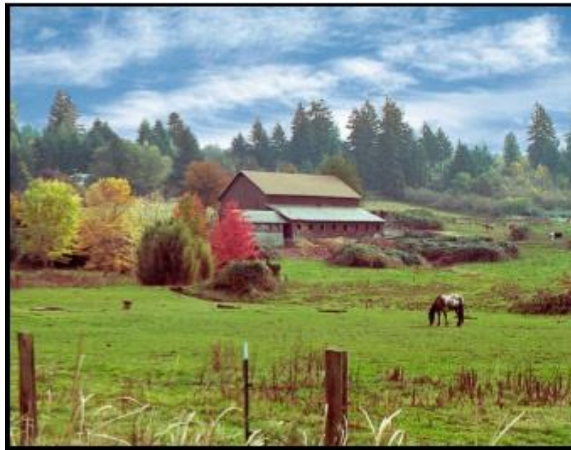
The Deardorff Barn, 1989