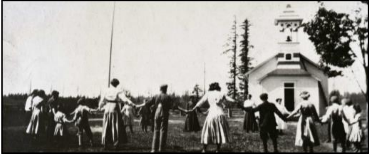
Students at recess at the first Happy Valley school, 1912