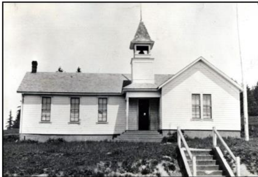
Sunnyside School, 1927

1884 – The Sunnyside School is established at the northeast corner of present-day 122nd and Sunnyside Roads. 8