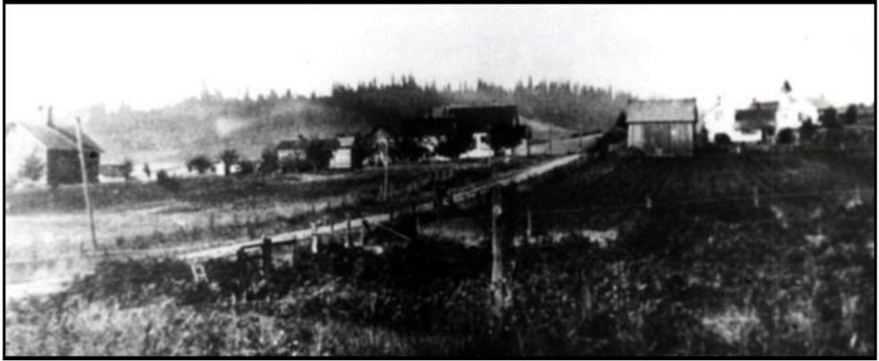
Sunnyside Road with Mount Scott in background, photo taken from the site of present-day Clackamas Promenade, early 1900s