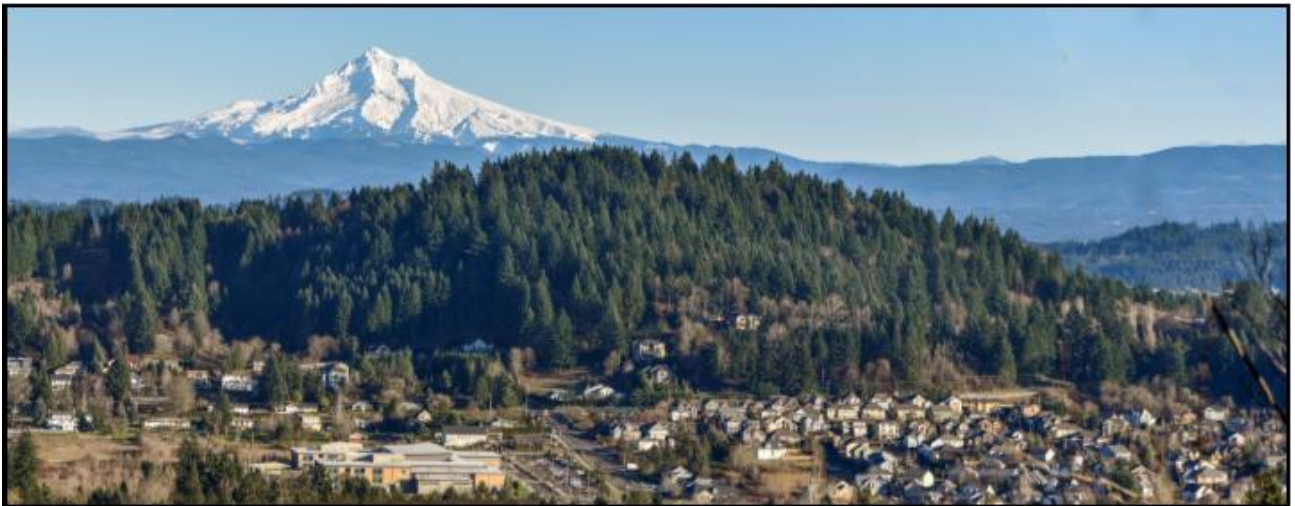
Scouters' Mountain and vicinity, 2015

August 28, 2014 – Scouters' Mountain Nature Park opens. 26