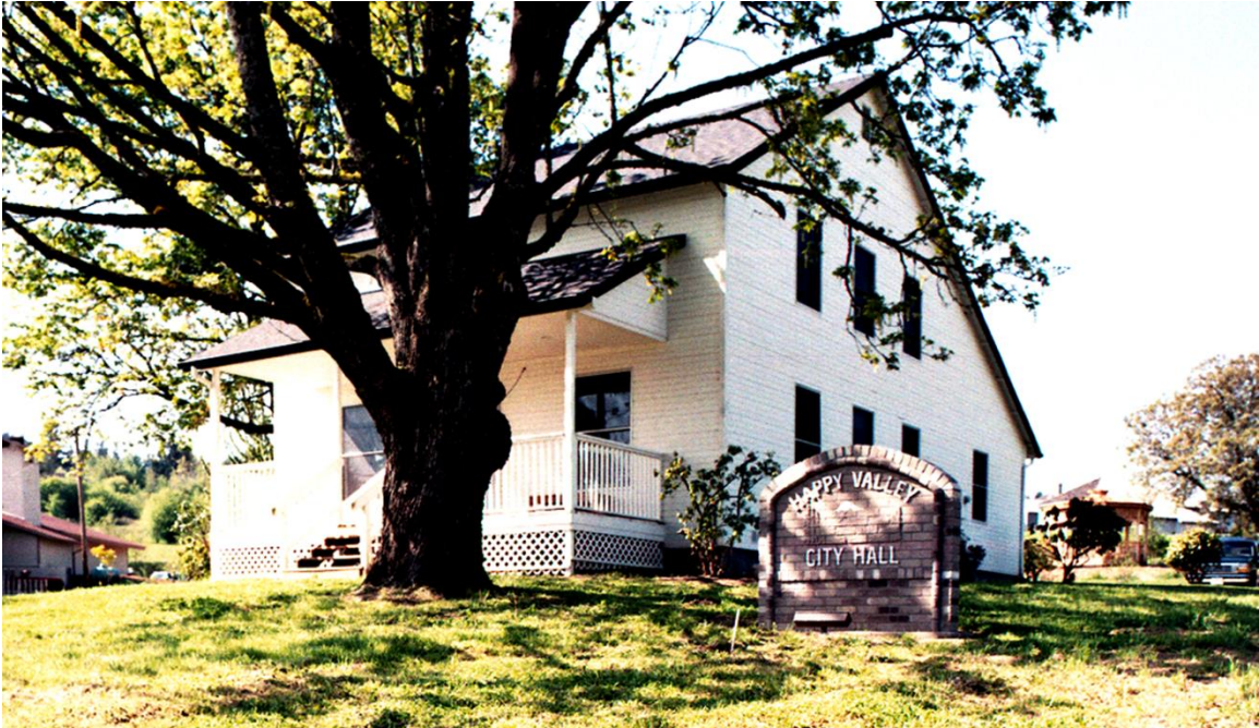
Happy Valley City Hall, 1994