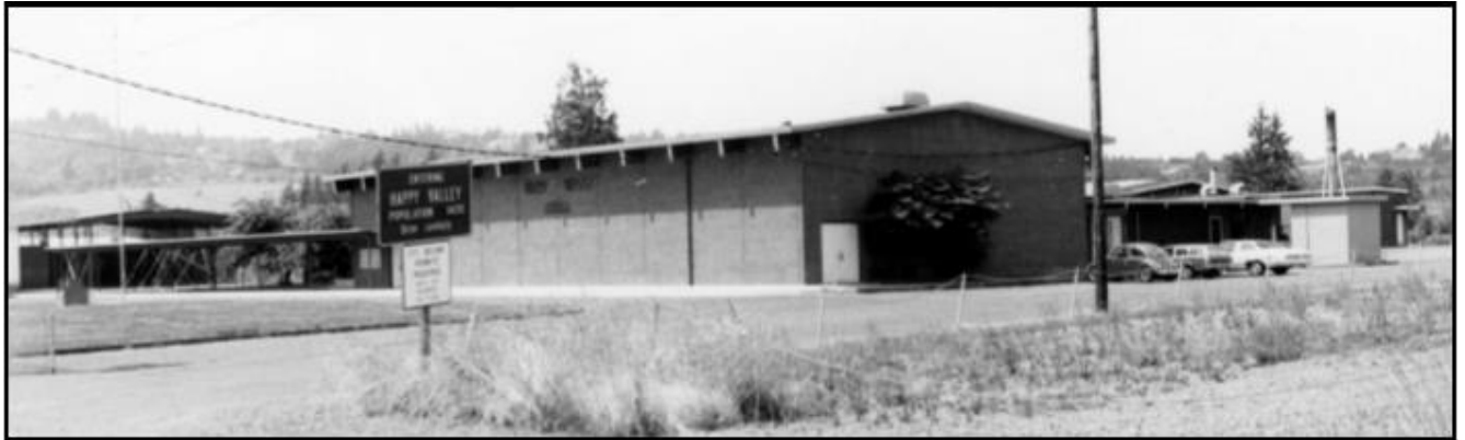
Happy Valley Elementary School, 1970s

2008 - The old Happy Valley Elementary School building is torn down and the present-day Elementary and Middle school building is constructed. 15