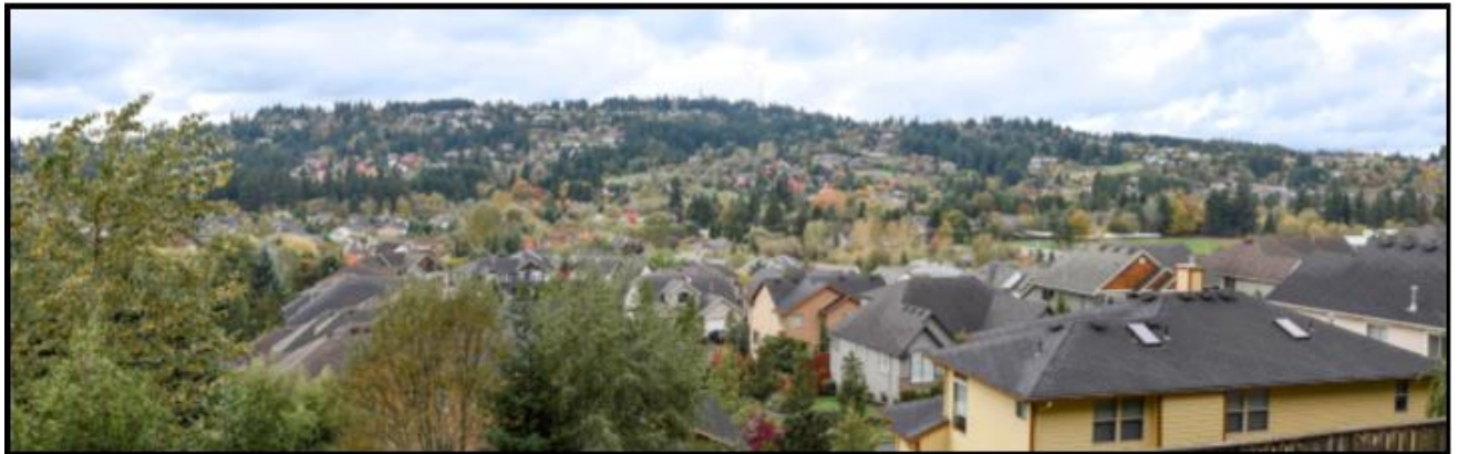
Overlooking the old Deardorff barn site looking towards Mount Scott, 2014

1997 – The historic Deardorff Barn is torn down to make way for the Happy Valley Heights Subdivision. 4