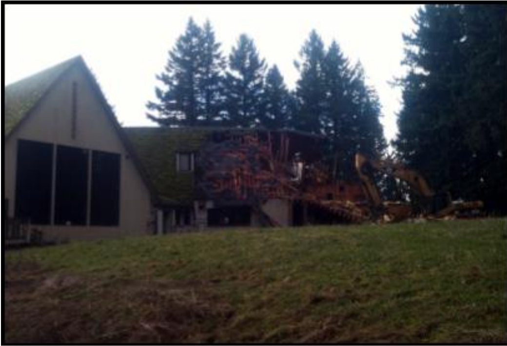
Chief Obie Lodge during demolition

2011 - The Chief Obie Lodge on Scouters' Mountain is deconstructed.