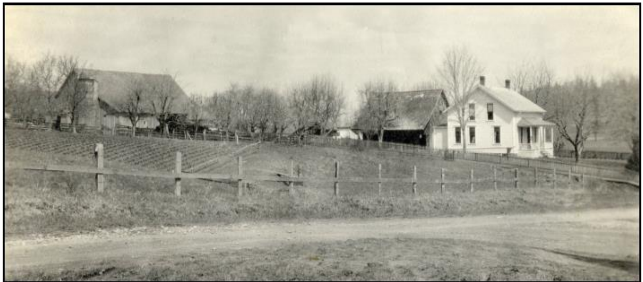
The Rebstock house at the corner of 129 th and King Road, date unknown

1991 – The historic Rebstock house, built in 1890, is demolished. The house was intended to be renovated and become the new city hall. The city offices at that time were located across the street in the same building as the Mount Scott Water District. The house was torn down due to termite damage and a new building in the style of an old farmhouse was constructed and became the City Hall. 2