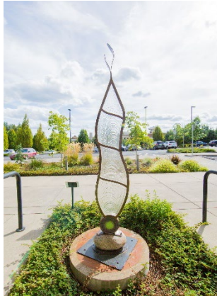
A Located between the bike racks adjacent to City Hall.