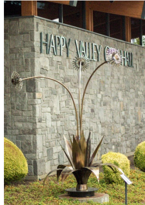
B Located right of entry stairs facing parking lot.