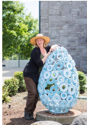
D Located in the garden area closest to Misty Dr.