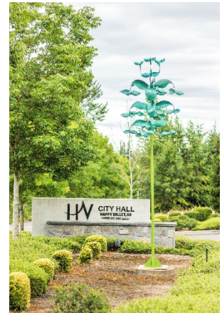
F Located at City Hall entrance sign/driveway.