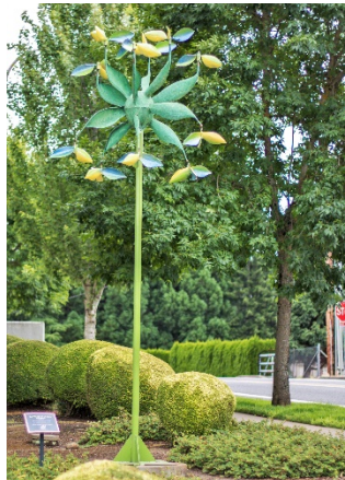
E Located on the corner of City Hall – visible from 162 nd Ave