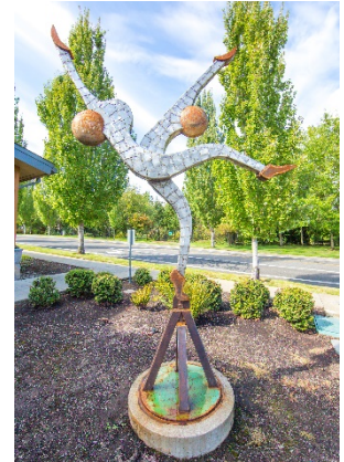
C Located in the garden area closest to Misty Dr.