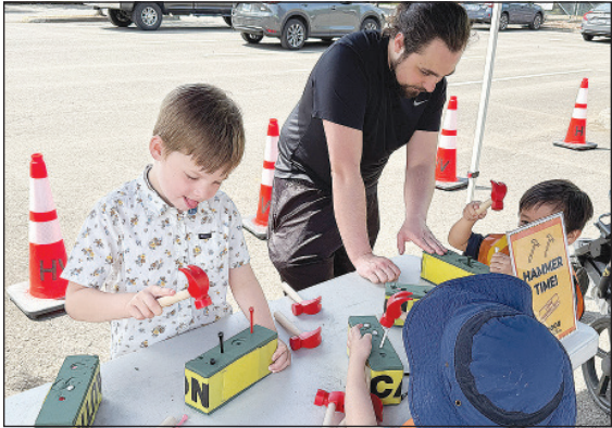
LEFT: Kids played ‘Pipeline’ and ‘Hammer Time’ with the help of our Public Works team.