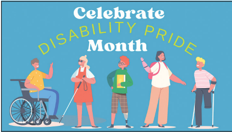
Celebrate Disability Pride Month with books from disabled writers, artists, and activists.

July is Disability Pride Month and to celebrate we are highlighting books from disabled writers, artists and advocates who have promoted a more open, inclusive and beautiful world. Find our list of creative works in literature, memoir and history as well as picture books and chapter books for younger readers here: go.lincc.org/hvdisabilitypride .