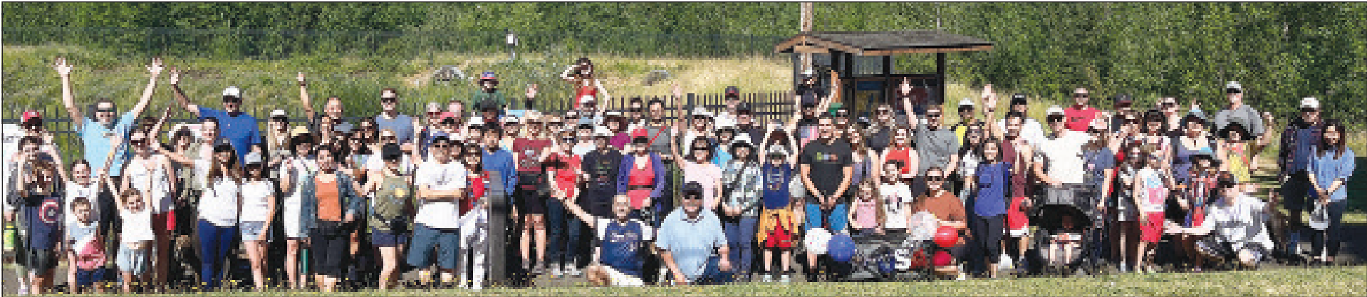
Independence Day Hike with Happy Valley Hikers