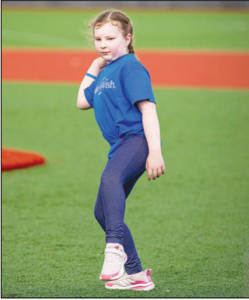
Local Wish Kid and Verne Duncan Elementary, Roslyn, throwing the first pitch at the Nelson High School baseball game.