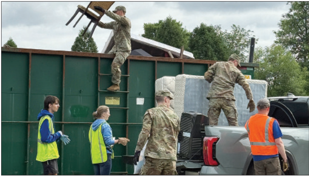
Members of the National Guard join City staff and volunteers assisting residents at Dumpster Day.

Dumpster Day continues to be a shining example of what’s possible when a community comes together to care for its environment — and each other.