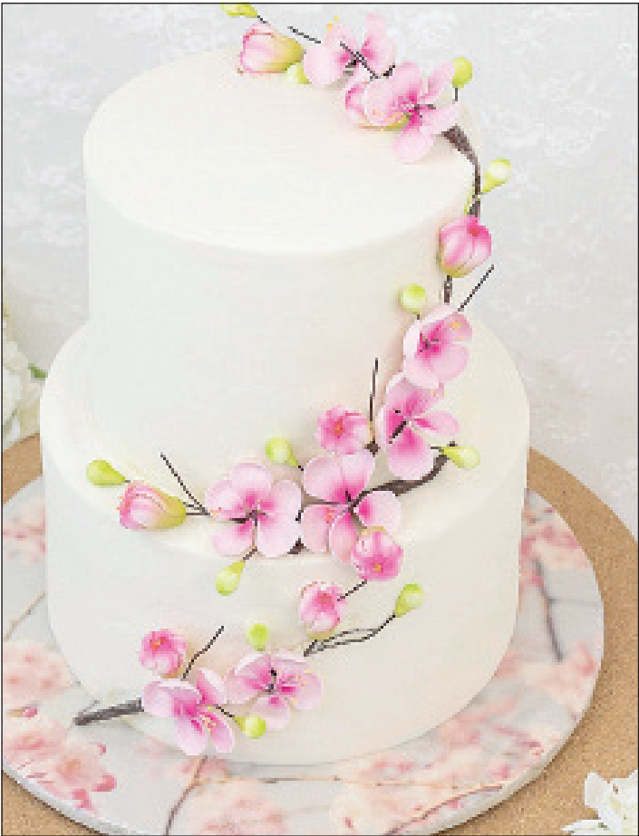
We Are Cake spends a full day on each wedding cake.

"It took a year to get everything done from