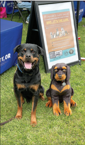
This sweet pup found an uncanny look-alike.

Happy Valley Parks and Recreation extends heartfelt thanks to the vendors, rescue groups, talented