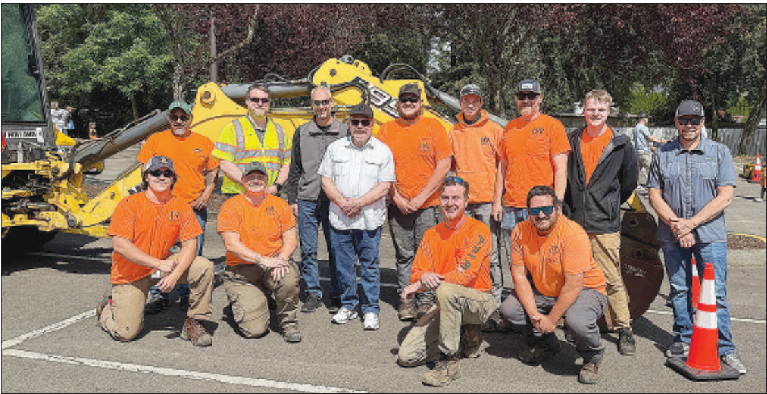
City of Happy Valley Public Works team members pose with the mayor and city manager.

Guests enjoyed delicious dirt cups, fun temporary tattoos and mini safety vests — just like the ones our Public Works crew wears on the job. Kids stayed busy with hands-on games like “Hammer Time,” “Pipeline” and digging in a sand pit, complete with a playful “car wash” station nearby. A major highlight was the opportunity to explore real Public Works vehicles up close. From big rigs and dump trucks to street sweepers, kids got to climb aboard and