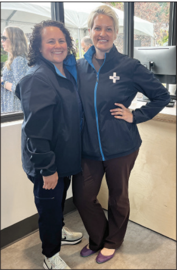
You will always be greeted with a smiling face at ZoomCare.

The providers at the Happy Valley clinic are board-certified and ready to handle a wide range