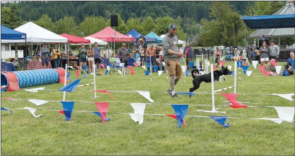
Savvy Dog Ranch and superstar pup Jet wows the crowd with a fast-paced agility demonstration.

A highlight of the day was the debut of Doggy Dream Homes — an inspiring display of handcrafted doghouses donated by local builders and businesses including PARR Lumber, Home Depot, Westlake Development Group and Holt Homes. The doghouses