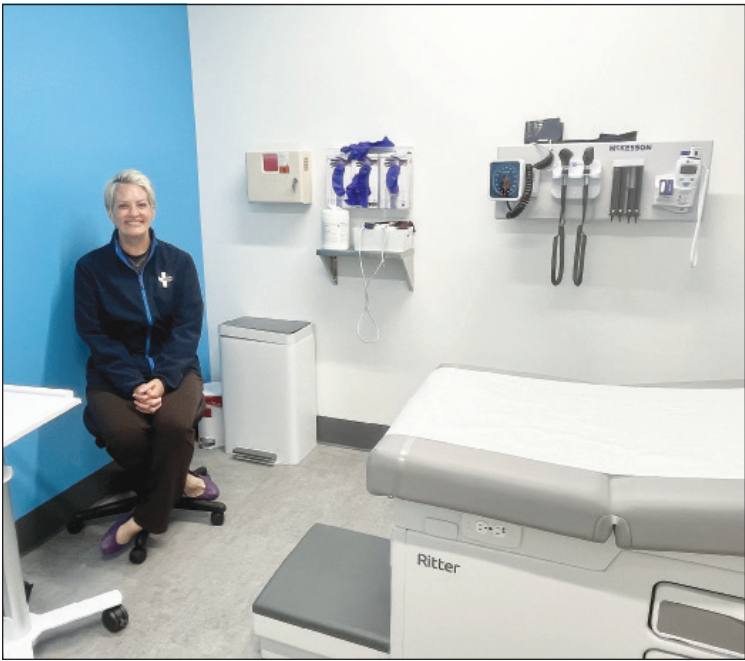
The ZoomCare PCPs are there to make sure that you are well taken care of in one of its fully equipped exam rooms.

For Happy Valley residents, this new ZoomCare clinic offers a fresh option for same-day, reliable care that fits into life without the usual hassle. Book online for an appointment online or in the ZoomCare app with a provider and get that medical help you need.