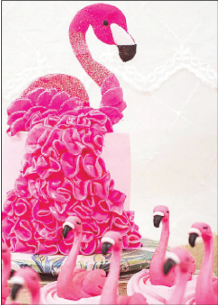
Flamingo cakes are among the many options at We Are Cake.

"It's been a dream come true, as we have a working kitchen, light retail, daily treats, etc." — Angela Morando, We Are Cake owner