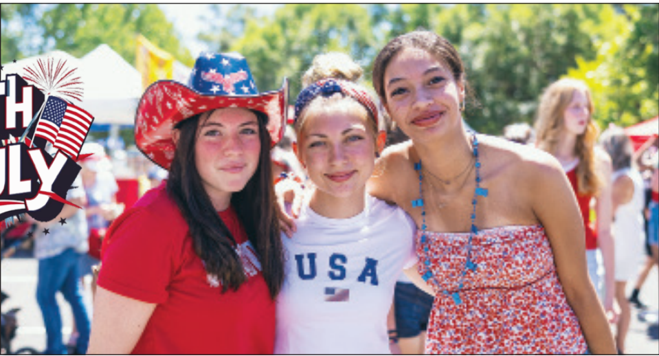
Break out the red, white, and blue because a fun filled day awaits this Independence