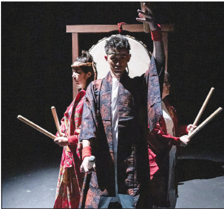
Enjoy amazing performers and presenters this summer at the Library!

Find out more details at go.lincc.org/hvsummerprograms .