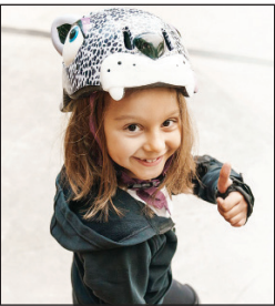
Helmets are a must at the Happy Valley Park skatepark.

Keep in mind that while we as Community Service Officers prioritize education and are happy to help clarify park rules you may have questions about, compliance is essential to avoid formal citations or exclusion from the park. Please help us work together to ensure all visitors can enjoy Happy Valley's parks this summer, safely and respectfully.