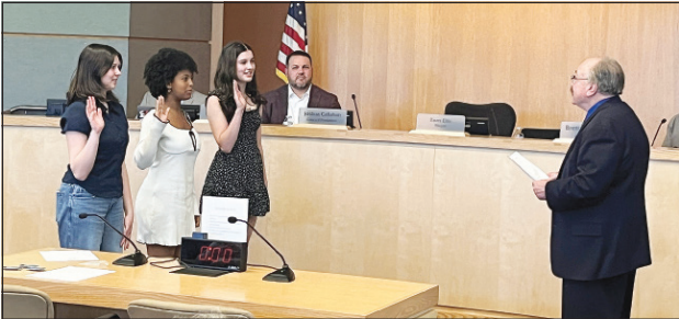
The new Youth Council members are sworn in.

and youth town halls on relevant topics that matter to teens. This year, the youth town hall included a discussion about the use of social media and how to cope without cellphones during the school day. The Happy Valley Youth Council also initiated the annual Oregon Youth Summit, a meeting of local youth councils from around the