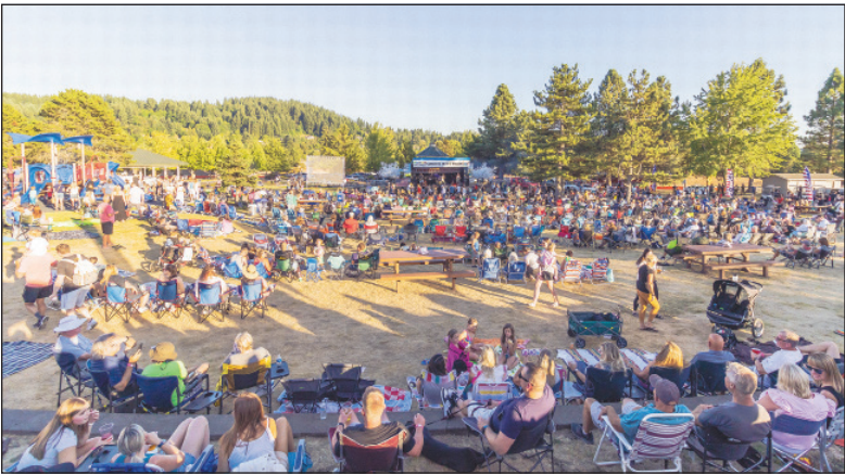
Between summer concerts, 4th of July, National Night Out and more, summer 2025 is set to be one to enjoy with friends and family.

weekly concert series for you. Concerts in the Valley begin July 10 at Happy Valley Park and continue each Thursday night. This year, the band lineup consists of tribute bands each week. In addition, there are a variety of fun activities planned to keep you and the kids entertained. Happy Valley Library’s Concerts in the Park series will also return on Friday nights starting July 25. These concerts take place on the lawn directly across from the main library building and are a great way to unwind after a long week. If you like to read, don’t forget to