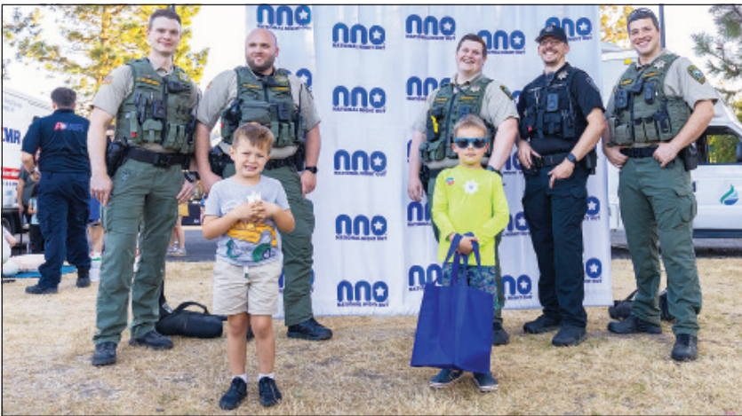
Deputies pose with future potential deputies on NNO 2024.

National Night Out is about more than safety — it's about connection.