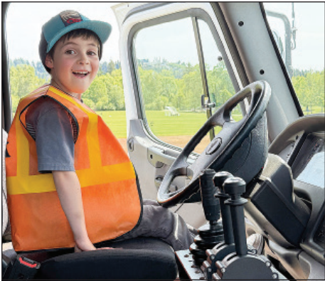
ABOVE: Residents got a chance to sit in the driver’s seat of several City big rigs during a recent event recognizing the team’s work.