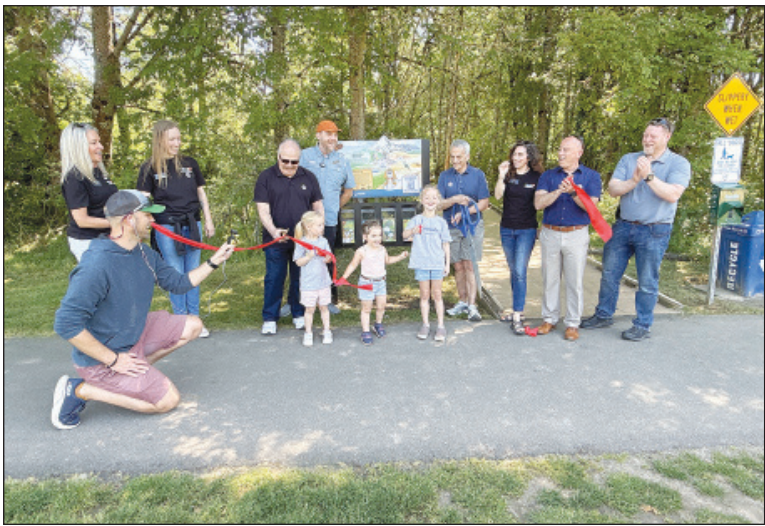
Local children helped our city staff and partners to cut the ceremonial ribbon on the trail.