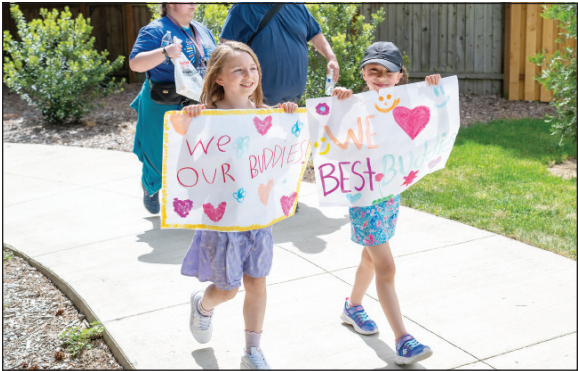
Every year, Best Buddies holds a Friendship Walk where the organization raises money and awareness for IDD.